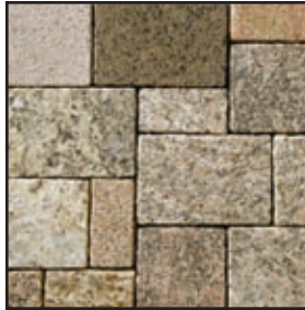
3 piece kit 6 x 9 | 6 x 6 | 3 x 6