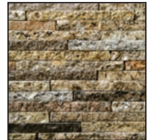
split stone 1¼ x 13