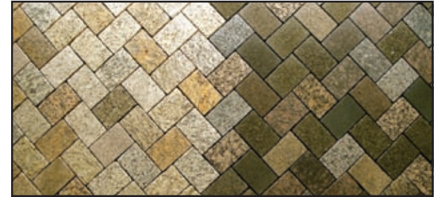
light blend paver