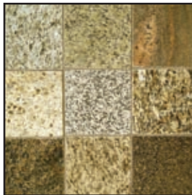
square 4 x 4 | 6 x 6 | 8 x 8