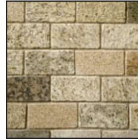
rectangle 3 x 6 | 4 x 8 | 6 x 9