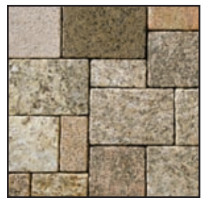
3 piece kit 6x9 | 6x6 | 3x6