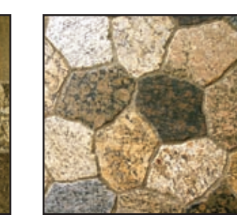
flagstone pavers 8 x 11