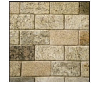
rectangle 3 x 6 | 4 x 8 | 6 x 9